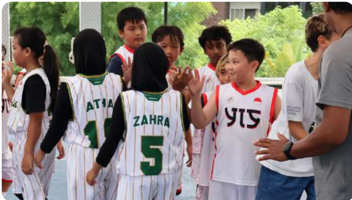
YIS PYP Basketball Team