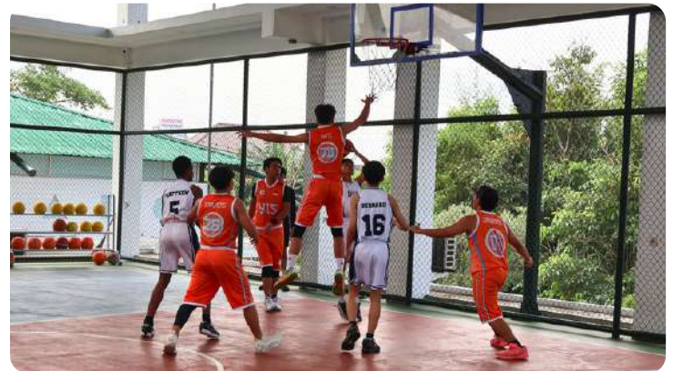
YIS MYP - DP Basketball Team

Our basketball court echoed with cheers and excitement as the YIS basketball teams hosted a series of friendly matches against schools from across Yogyakarta. These matchups were more than just games; they served as a dynamic "classroom" on the court. Our student-athletes had the chance to put their training into practice, applying fundamental skills like passing, dribbling, and shooting under the pressure of real-game situations.